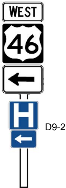
Off Ramp Assembly Option 2