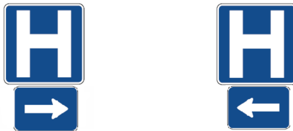
Figure 2D.4.1 Hospital Assembly for Non-Interstate Routes