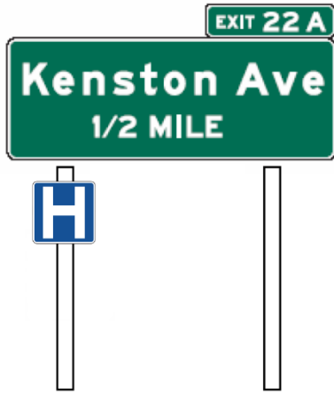
1/2 Mile Assembly